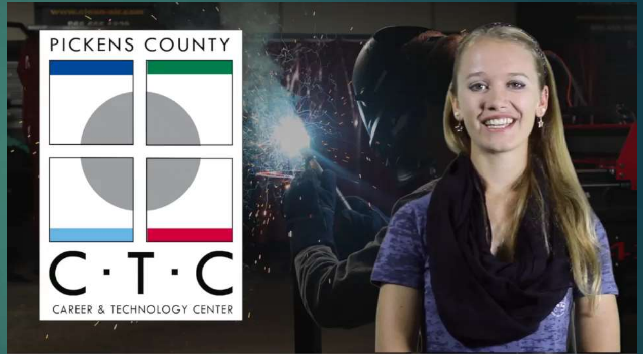
The Pickens County Career and Technology Center