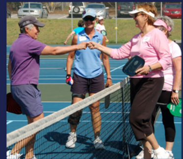
Upstate Senior Issues Group