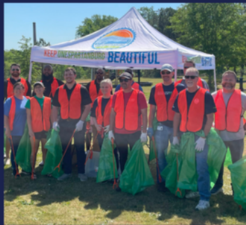
Upstate Natural Resources