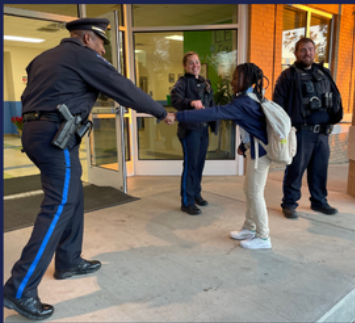
Creating a Safer Upstate